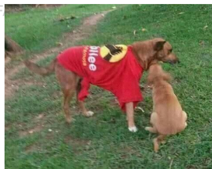
Picture: A Bungoma youth being stripped off Jubilee branded t-shirt and dressed to a stray dog